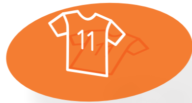
FOOTBALL CLUBS & YOUTH ACADEMIES

The soul of teqball is the table; a new and revolutionary piece of sports equipment which took over two years’ testing and research to eventually develop its final innovative and sophisticated shape. The net is solid plexi and thus the ball bounces back from it, so the concept of uninterrupted games is no longer a dream.