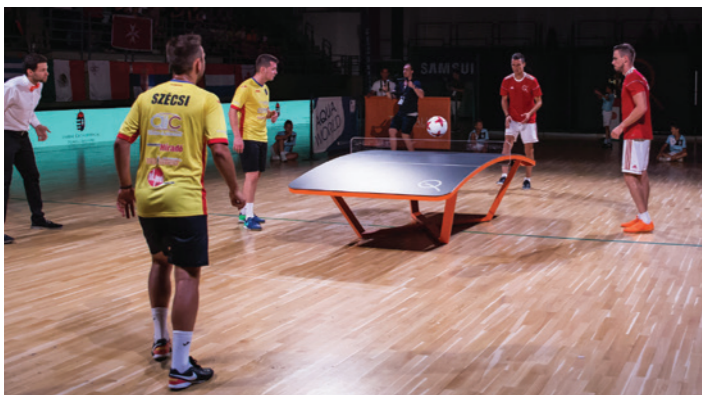
1 ST TEQBALL WORLD CUP