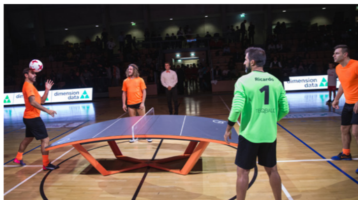
TEQBALL ALL STARS SHOW